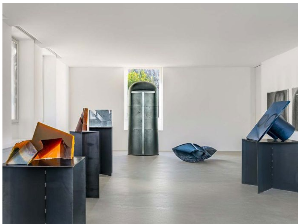
Vetro boemo: i grandi maestri, The Venice Glass Week, 2023.

#TheArtofFire , the seventh edition of The Venice Glass Week , begins on 9 th September with over 250 events dedicated to the art of glass. Founded in 2017, the international festival aims to celebrate, support and promote the art of glassmaking. The city-wide festival will feature more than 250 events organised by over 200 participants across 140 venues , all