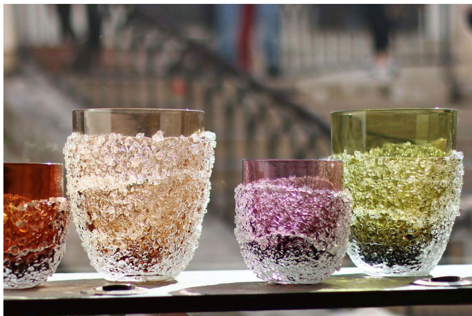
Micheluzzi Glass, Ghiaccio.