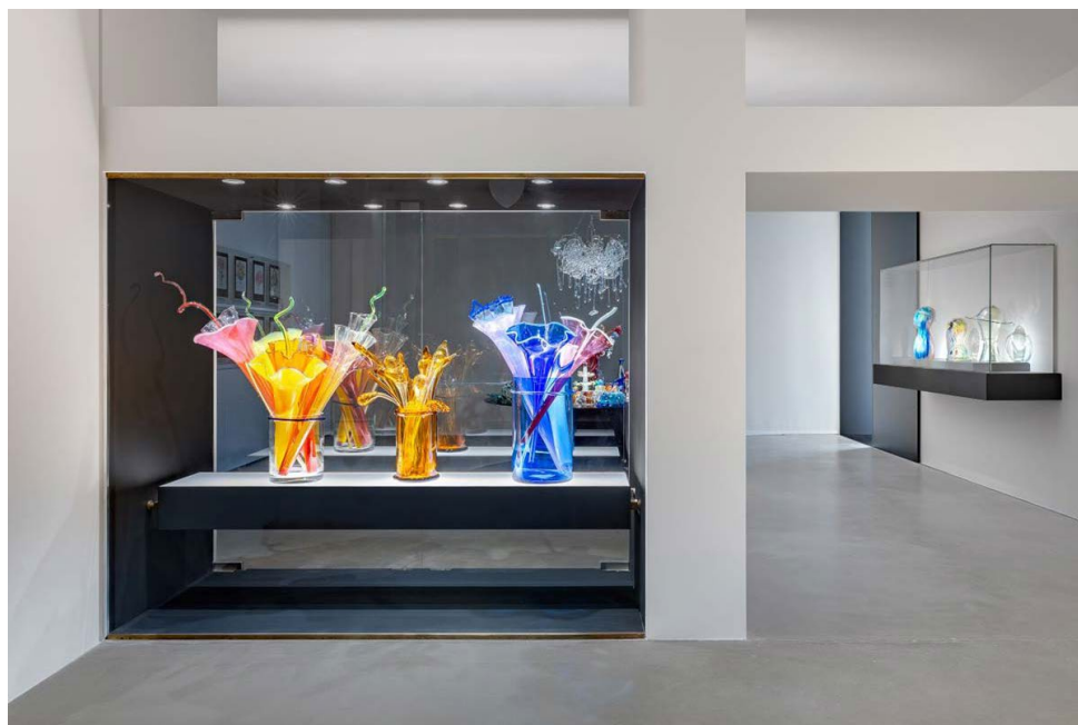
Vetro boemo: i grandi maestri, The Venice Glass Week, 2023.