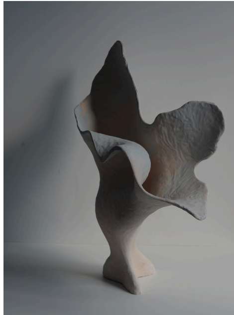
Olga Sabko, Sans ciel , 2024 Ceramic earthenware, 19 x 22 1/2 x 9 in