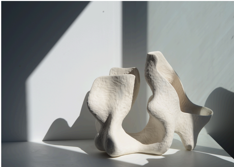
Olga Sabko, Nomade , 2024, Ceramic earthenware, 17 3/8 x 22 1/2 x 12 1/4 in