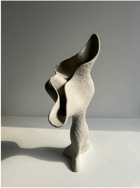
Olga Sabko, Listener II , 2025 Ceramic earthenware, 25 x 15 x 9 1/2 in