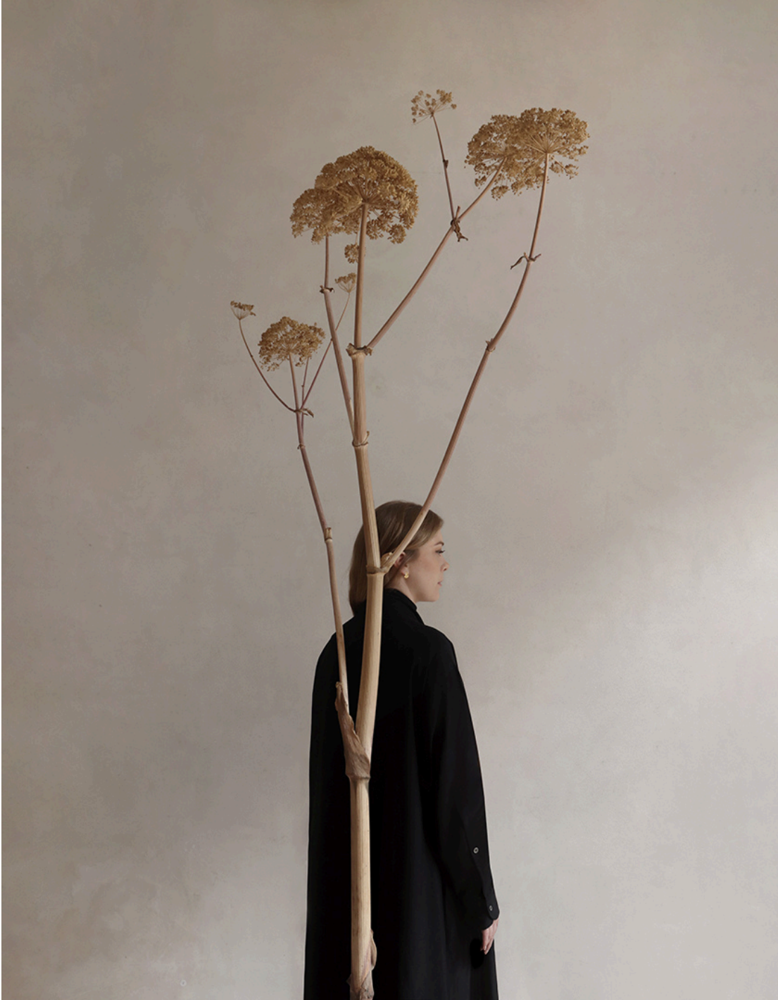
Zoe Imber.